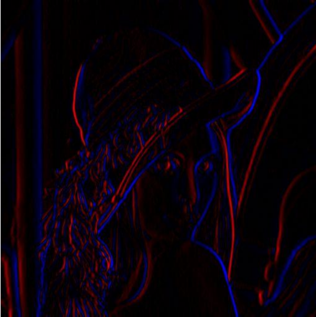
Pic.4 Prewitt 5x5 horizon gradient of Lenna