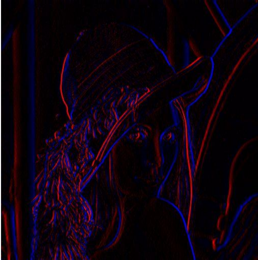
Pic.2 Sobel 3x3 horizon gradient of Lenna