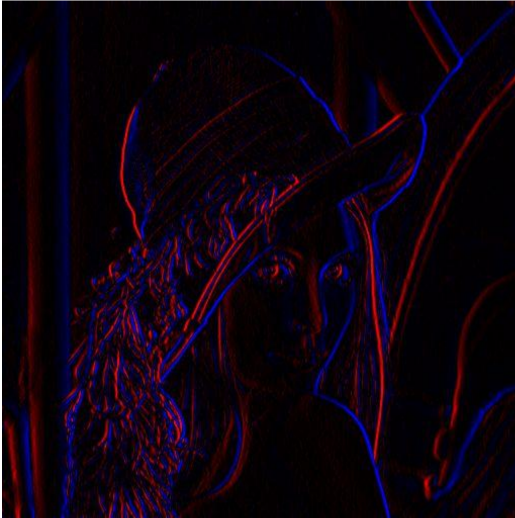
Pic.1 Prewitt 3x3 horizon gradient of Lenna